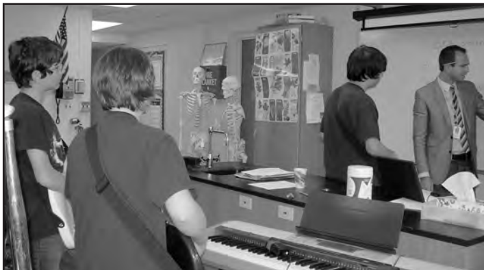
A science lab is multi-purposed as a music room.