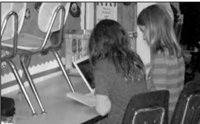
Hallways often serve as break-out space where students can work in small groups.

All community members are encouraged to participate in this important process! It is not necessary that you attend all meetings. Please join us whenever you are able. Future meetings will take place on May 4, May 25 and June 22.