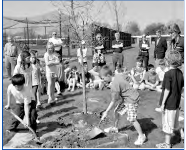
Fourth graders helped Village officials plant a tree in Willow Park on Arbor Day.

The Board has now charged the Facilities Study Committee with preparing a facilities plan, which will include specific short term and long-term projects, refined costs, and a general time frame for project completion. The air conditioning of both schools, considered by the Board for several years, was identified as a high priority and may be part of the short-term list. The top programmatic projects under consideration for the near future include breakout rooms and multipurpose space at both