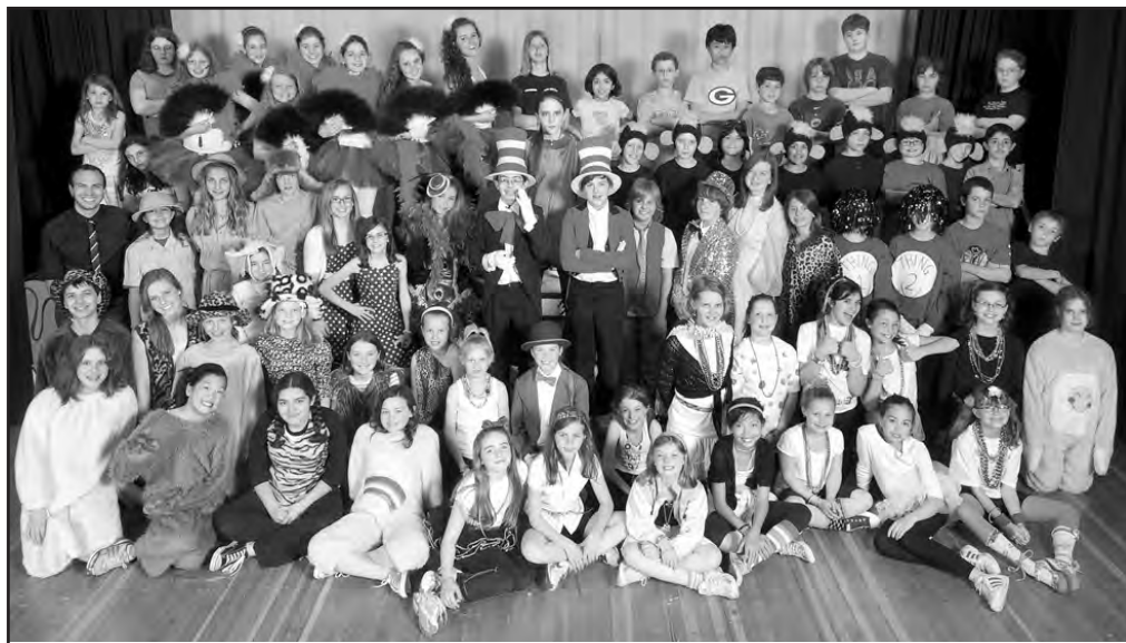
The cast and crew of “Seussical, Jr.”