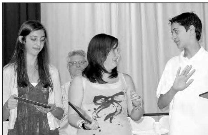
Award recipients were honored at end-of-year assemblies. Their names will be added to plaques hanging in the foyer at Sunset Ridge.