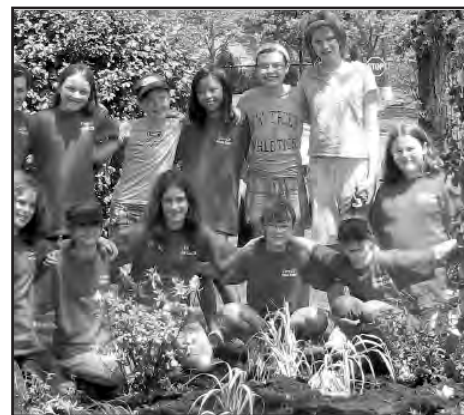
Girl scouts display their newly planted shrubs at Sunset Ridge School.

Fifth grade girl scouts in troop #608 brainstormed ideas for improving Northfield as part of a leadership program to make a difference in their community. The