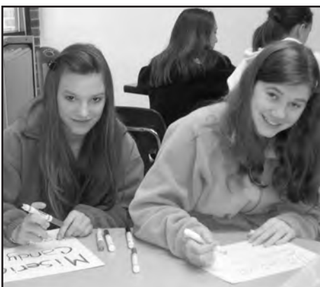
Seventh grade students made and displayed posters announcing the Misericordia Candy Day sale.

Service learning integrates meaningful community service with instruction and reflection to enrich the learning experience and promote civic responsibility. Two such activities took place at Sunset Ridge this spring.