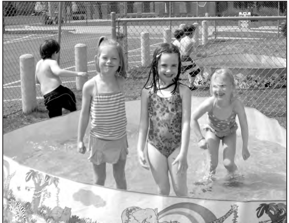
Kindergarten classes took advantage of a warm, sunny day in May to enjoy their splash party, a favorite annual event.

The faculty and students at Middlefork and Sunset Ridge Schools extend a heartfelt thank-you to our parent and community volunteers for the many ways you contribute to our schools. Whether in the classrooms, lunchrooms, or libraries, helping with projects, sharing a special talent, participating in the PTO or on a committee, we value all you do on behalf of our schools.