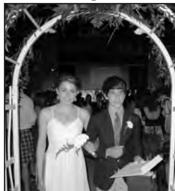
Diplomas in hand, students were all smiles during the recessional.