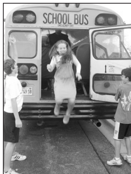
Seventh graders practice bus safety evacuations during the first week of school.