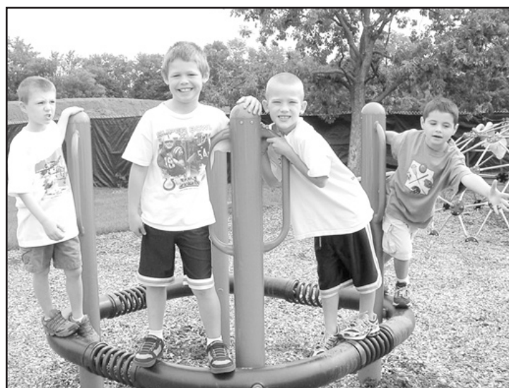
Second graders enjoy playing together at recess on the first day of classes.