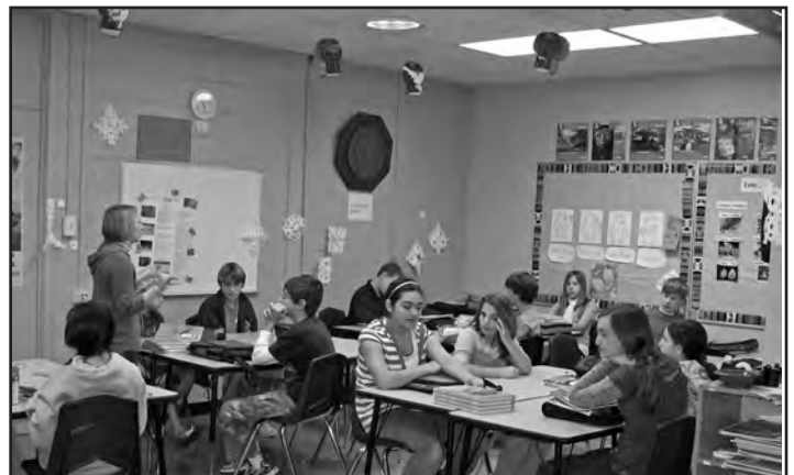
The new 4th-6th grade Spanish classroom is in space formerly dedicated to a computer lab.