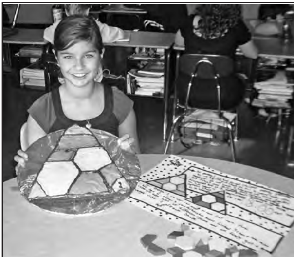
One student presented her design solution with a real cake.