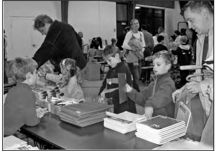
Participants at Middlefork Service Night gathered supplies into school kits for children in need attending the Chicago Public Schools.