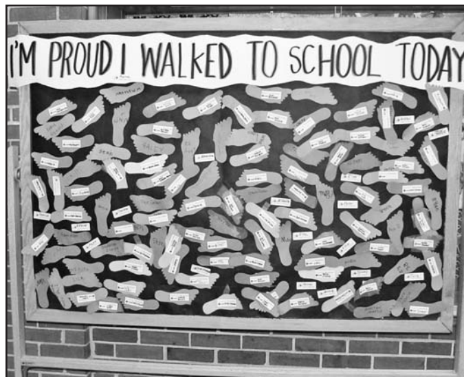
Student participants in Walk to School Day signed footprints on display in the Middlefork foyer.