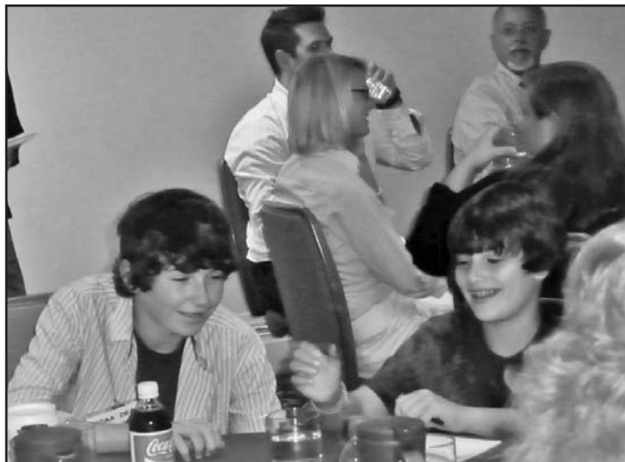
Sunset Ridge students participate in a think tank on social networking at the Digital Achievement Awards ceremony in Hollywood.

who requested contributions to PAWS (Pets Are Worth Saving) in lieu of birthday presents and was featured in the "Winnetka Talk."