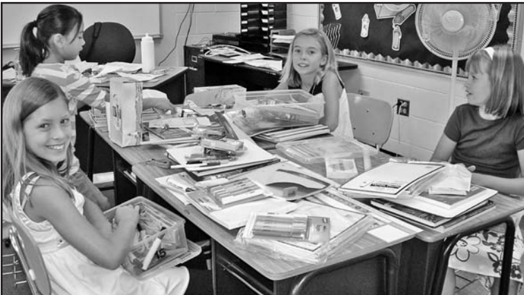
Fourth graders organize their school supplies on the first day of school.